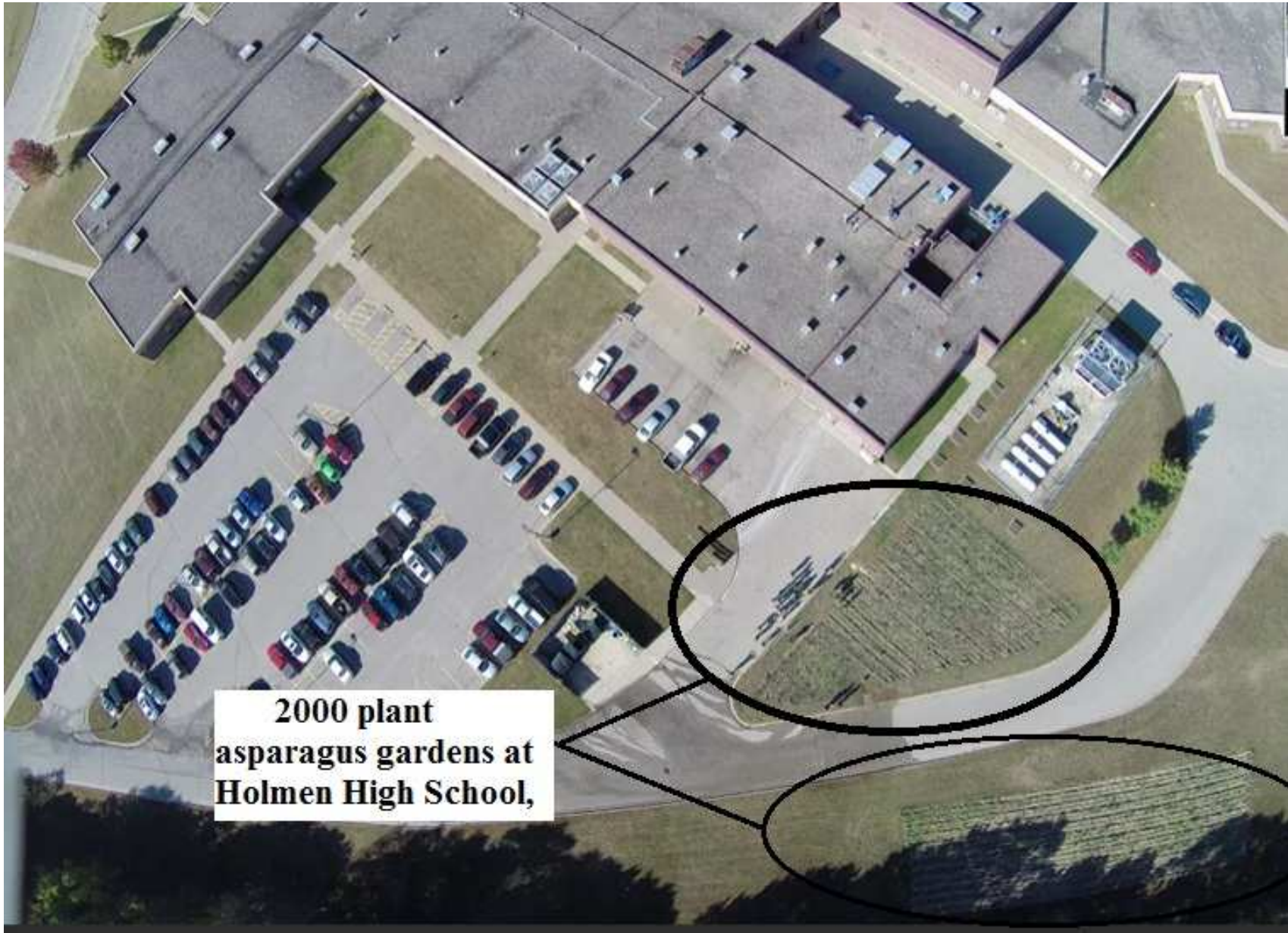
2000 plant asparagus gardens at Holmen High School,