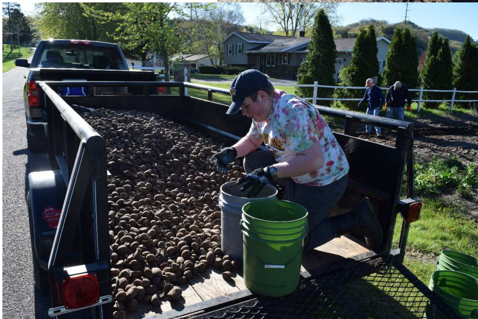
2016, a local farmer donated 3 acres of land to the Holmen FFA for use in the Farm to School program. We have grown Sweet Corn, Potatoes and most recently watermelon in this field.